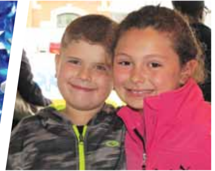
Relay for Life