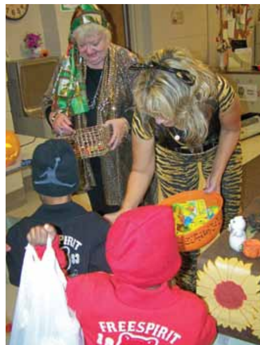
Day Care Visits for Trick or Treat