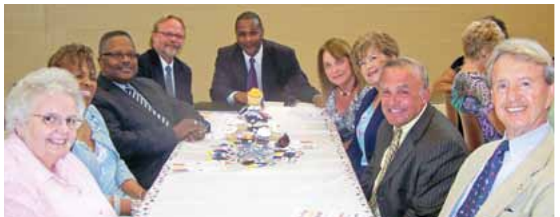
High School Graduation Day