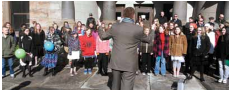
Adoption Day at the Trumbull County Courthouse