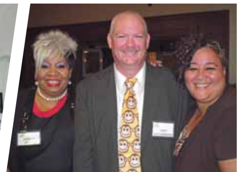
Foster Parent Dinner Speakers